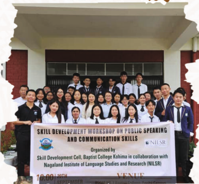
SKILL DEVELOPMENT WORKSHOP ON PUBLIC SPEAKING AND COMMUNICATION SKILLS Organized by Skill Development Cell, Baptist College Kohima in collaboration with Nagaland Institute of Language Studies and Research (NILSR) 10:00 | 20TH SEPTEMBER | VENUE