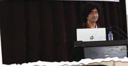
Career Guidance Talk