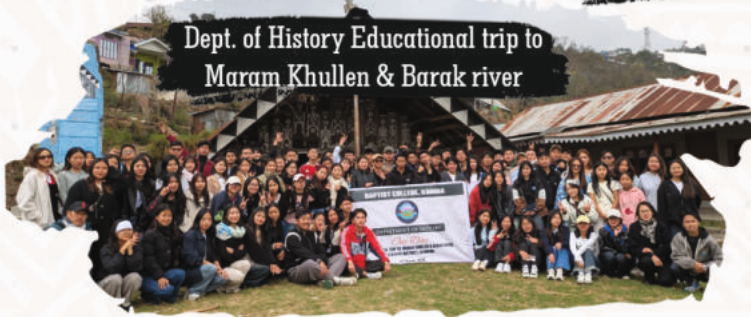
Dept. of History Educational trip to Maram Khullen & Barak river