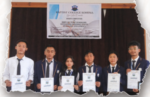
Legal Aid Committee Debate Competition