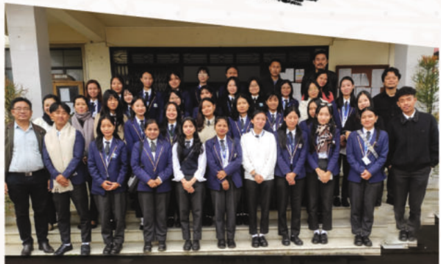
Motivational Talk for Advanced Learners 1st November, 2025

University of St Andrews A TALK ON WAR THROUGH AN INTERSECTIONAL LENS Organized by the Department of Political Science, Baptist College, Kishino, Nagaland, India in Collaboration with The University of St. Andrews, United Kingdom DATE: 5TH MARCH, 2026 | TIME: 2:00 PM VENUE: RIVENBURGS MEMORIAL CHAPEL