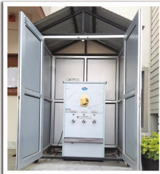
DRINKING WATER FACILITY