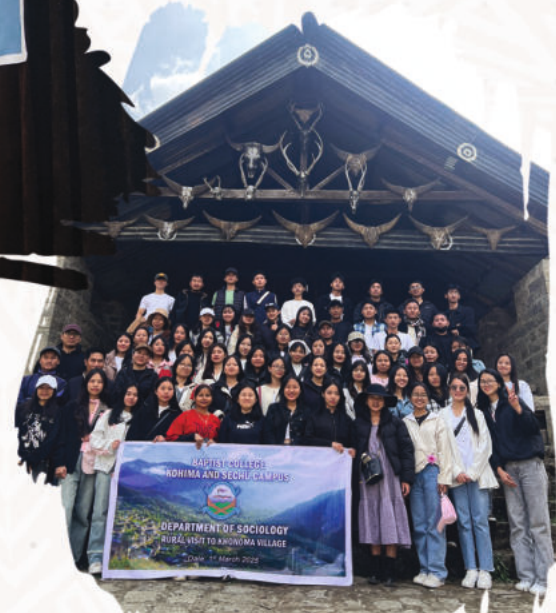
BAPTIST COLLEGE KOHIMA AND SECUR CAMPUS DEPARTMENT OF SOCIOLOGY RURAL VISIT TO KHONGMA VILLAGE