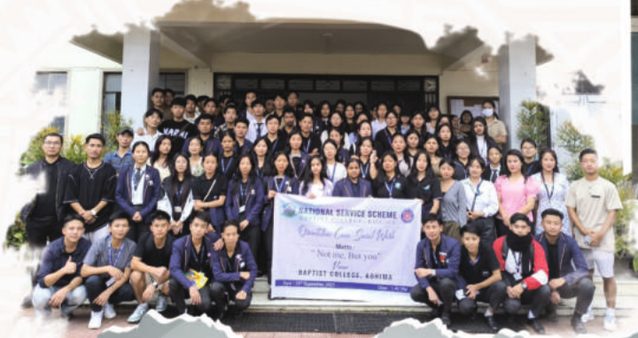
REGIONAL SERVICE SCHEME "Quicken Your Spiritual Walk" Motto: "Not One, But You" BAPTIST COLLEGE, SECHU