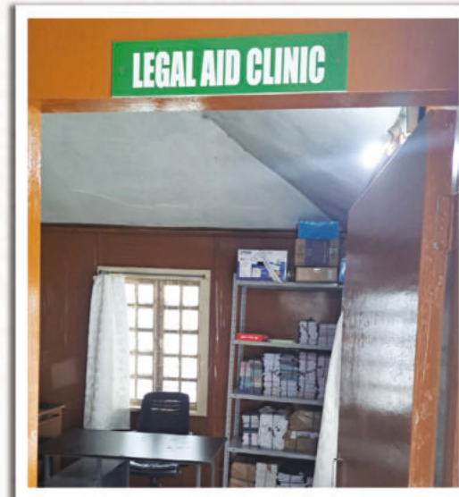
LEGAL AID CLINIC