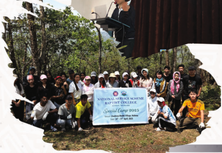
NATIONAL SERVICE SCHEME BAPTIST COLLEGE Special Camp 2025