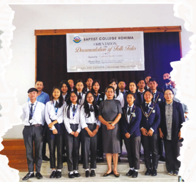
BAPTIST COLLEGE KOHIMA ORIENTATION OF Documentation of Folk Tales