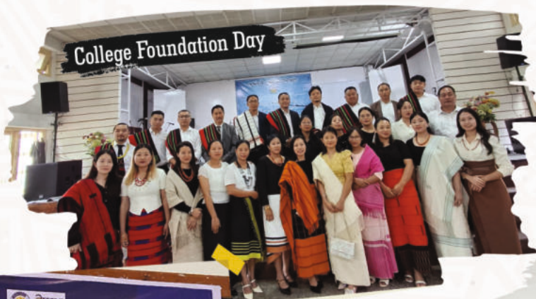
College Foundation Day