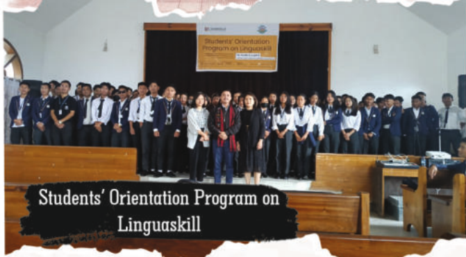
Students' Orientation Program on Linguaskill