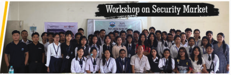
Workshop on Security Market