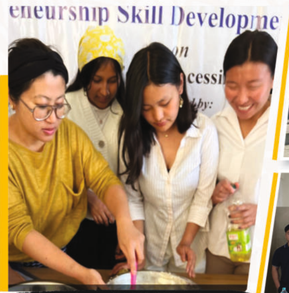
Entrepreneurship Skill Development