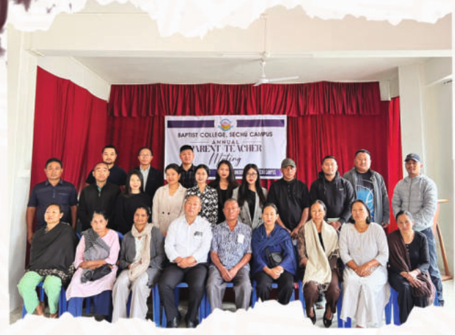
BAPTIST COLLEGE, SECHU CAMPUS PARENT-TEACHER MEETING