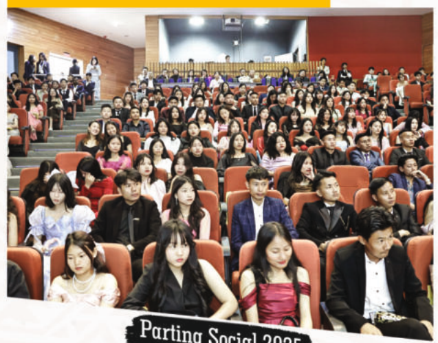
Parting Social 2025