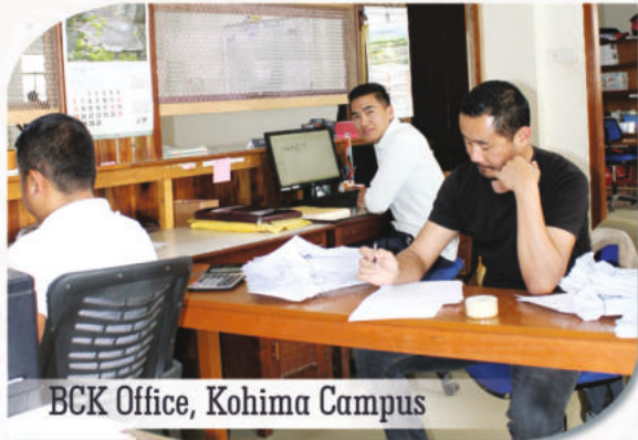
BCK Office, Kohima Campus

The Yearbook Team takes up the responsibility of publishing Annual Yearbook for the graduating students. The Yearbook contains record of functions and activities covering the three year period of the students' stay in the college. In addition to being a memory book, it contains record of all students' individual details with photographs to enable graduates to stay connected even after graduation.