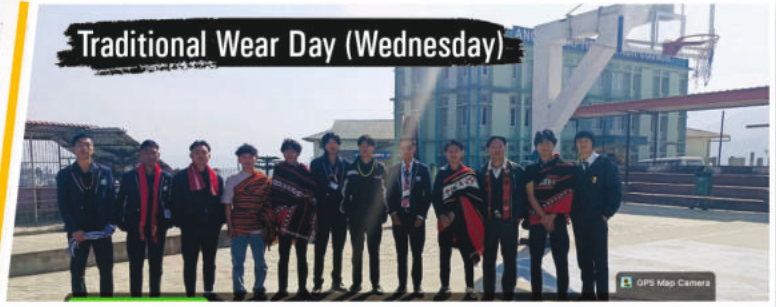
Traditional Wear Day (Wednesday)