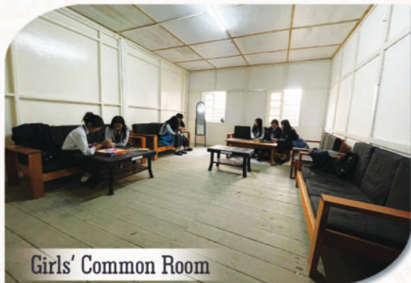
Girls' Common Room