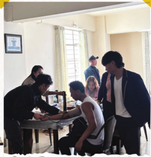
Blood Donation Drive