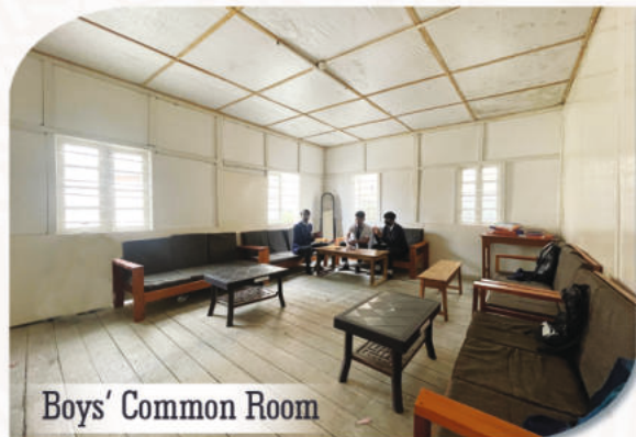
Boys' Common Room