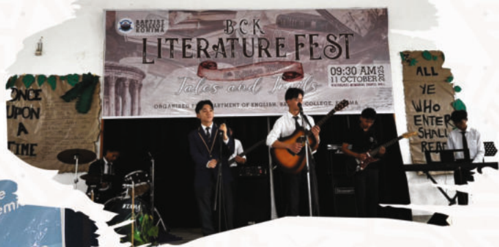
BCK LITERATURE FEST