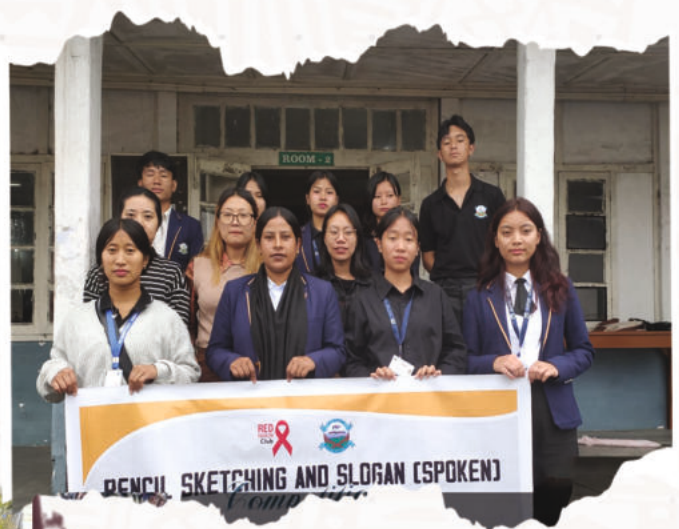
PENCIL SKETCHING AND SLOGAN (SPOKEN)