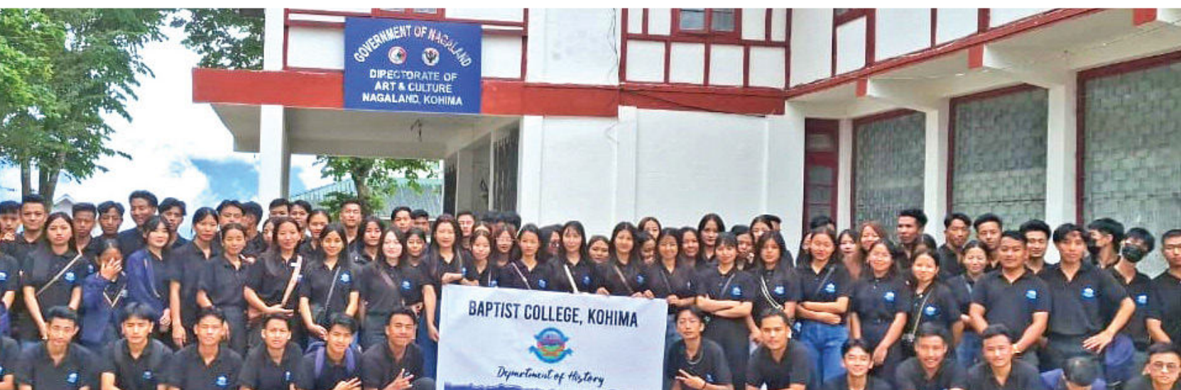
GOVERNMENT OF NAGALAND DIRECTORATE OF ART & CULTURE NAGALAND, KOHIMA