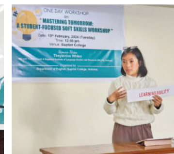
ONE DAY WORKSHOP ON "MASTERING TOMORROW: A STUDENT-FOCUSED SOFT SKILLS WORKSHOP"