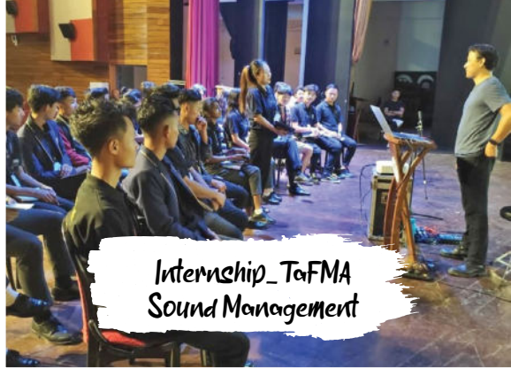
Internship_TaFMA Sound Management