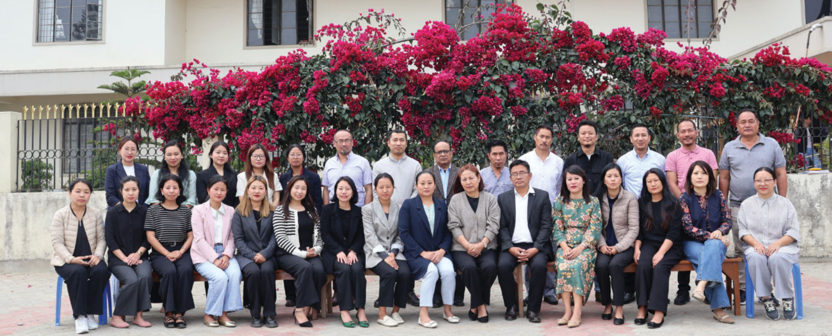
TEACHING FACULTY, KOHIMA CAMPUS