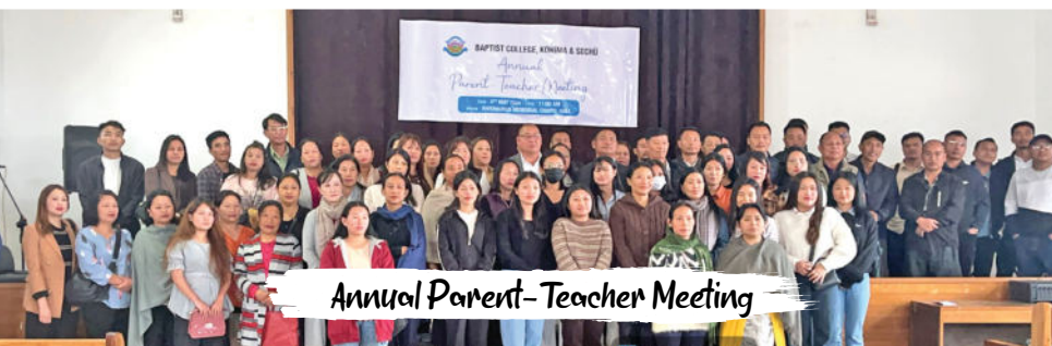
Annual Parent-Teacher Meeting