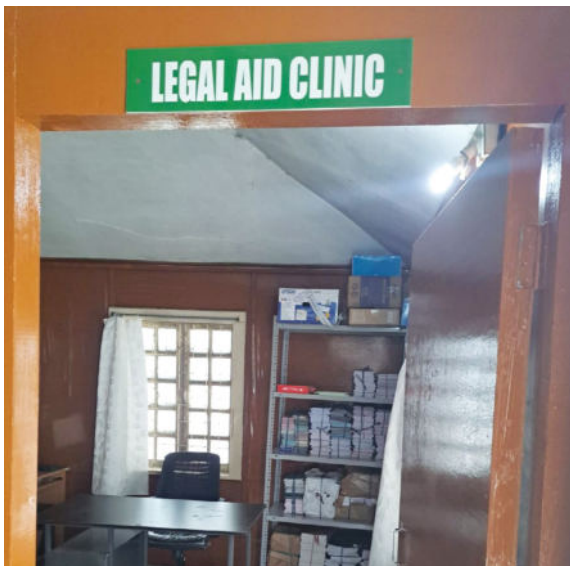
LEGAL AID CLINIC