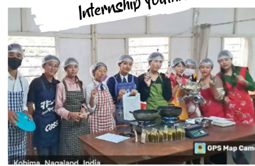
GPS Map Cam