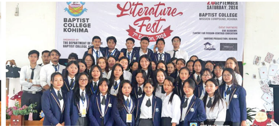
BAPTIST COLLEGE KOHIMA Literature Fest 7th Edition, 2024 SATURDAY, 15 FEBRUARY, 2024 BAPTIST COLLEGE MISSION COMPOUND, KOHIMA