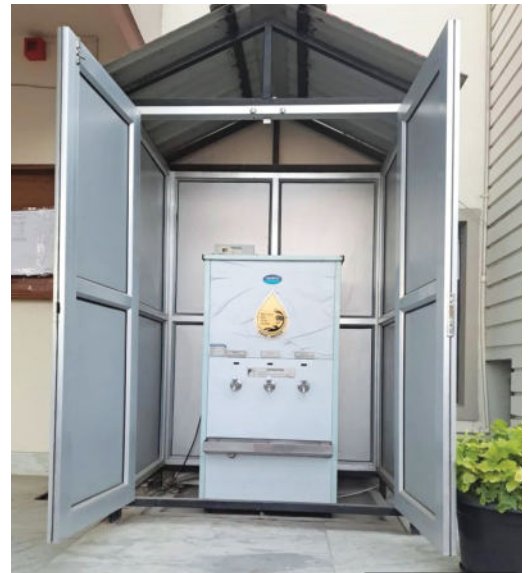
DRINKING WATER FACILITY