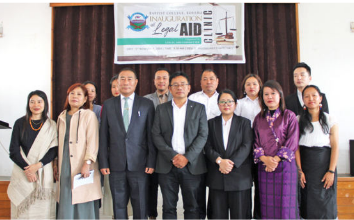
BAPTIST COLLEGE, KOHIMA & SECHU INAUGURATION OF Legal AID CLINIC