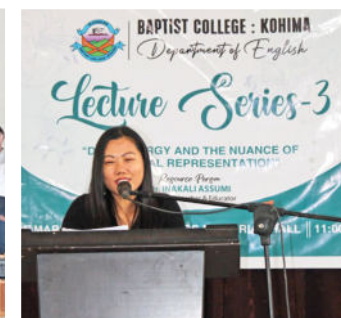
BAPTIST COLLEGE : KOHIMA Department of English Lecture Series-3 "ENERGY AND THE NUANCE OF LINGUISTIC REPRESENTATION"