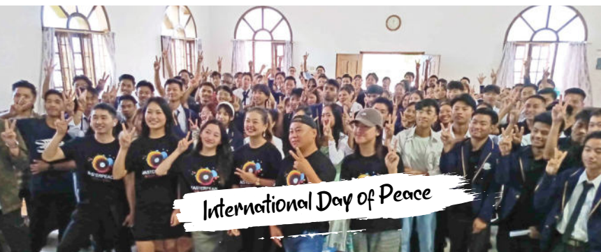
International Day of Peace