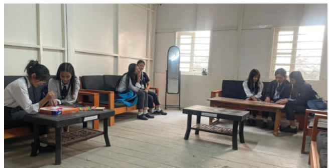
GIRLS' COMMON ROOM