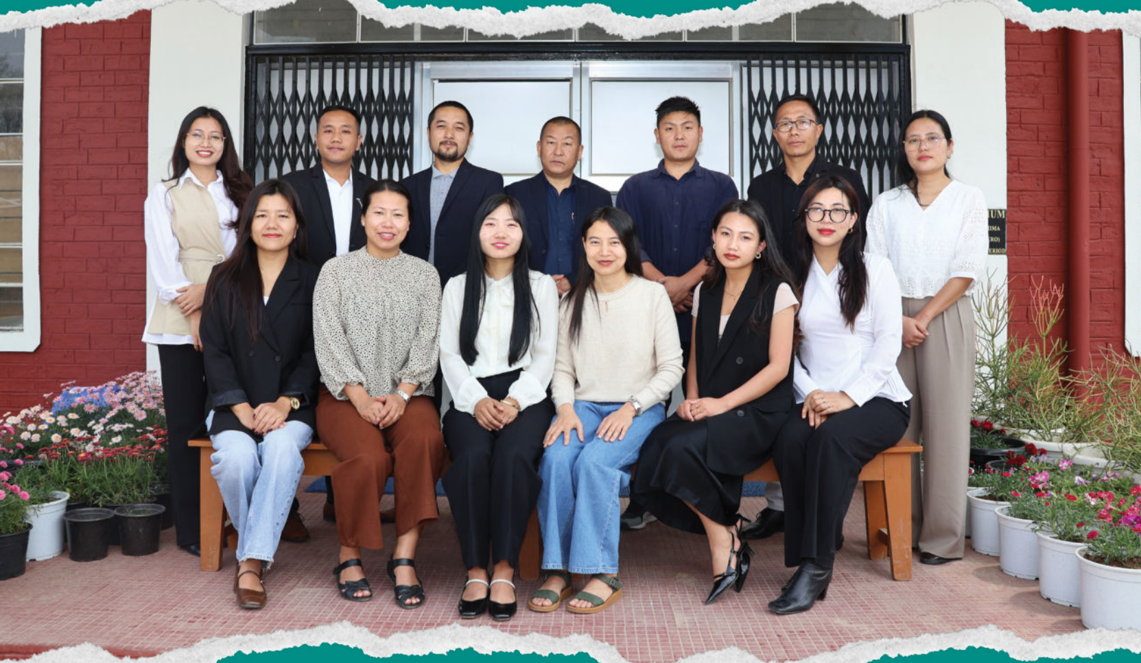
TEACHING FACULTY, SECHÜ CAMPUS