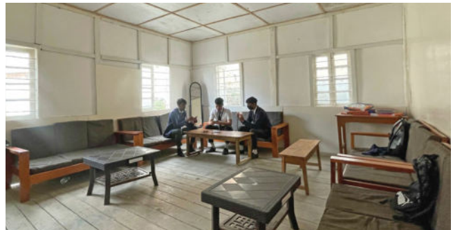
BOYS' COMMON ROOM

The Yearbook Team comprising of faculty members, Literary Secretary, Student Council take up the responsibility of publishing Annual Yearbook for the graduating students. The Yearbook contains record of functions and activities covering the three year period of the students' stay in the college. In addition to being a memory book, it contains record of all students' individual details with photographs to enable graduates to stay connected even after graduation.