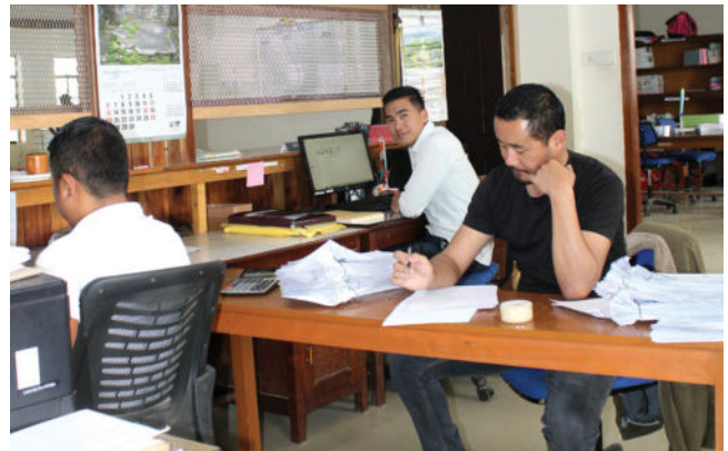
BCK OFFICE, KOHIMA CAMPUS