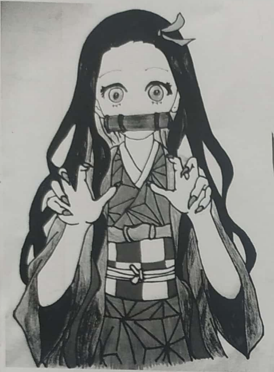
Neiphretuonuo 6 th Semester