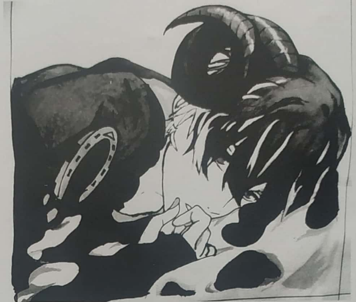
Teisovinuo Solo 6 th Semester