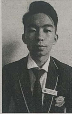
Pfütsükote Ketsu Koza