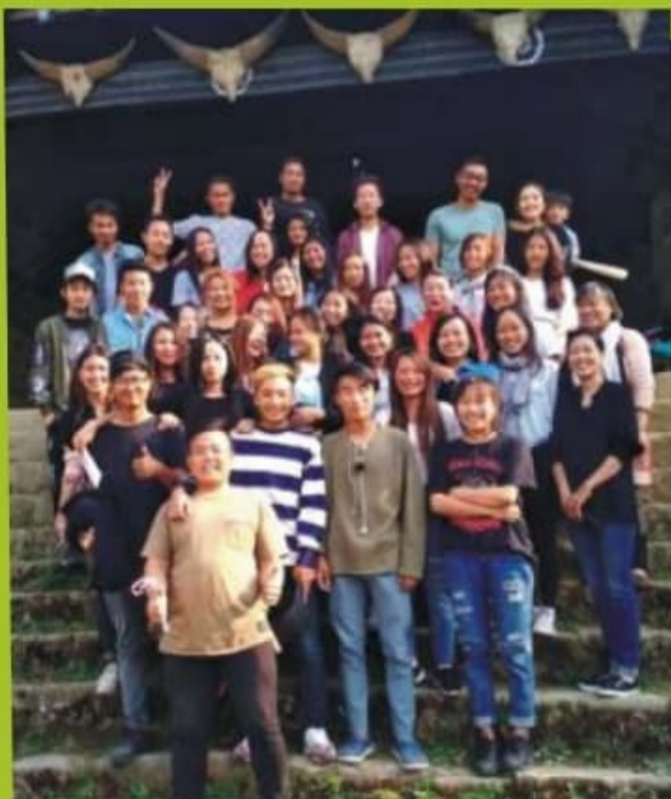
B.A.Eng 6 th Sem, Outing to Khonoma Village. Kohima