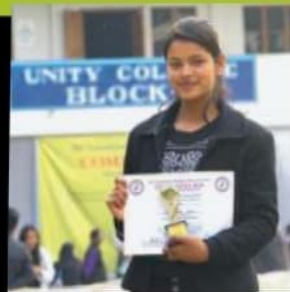
B. Com students at COMMVANZA Unity College,