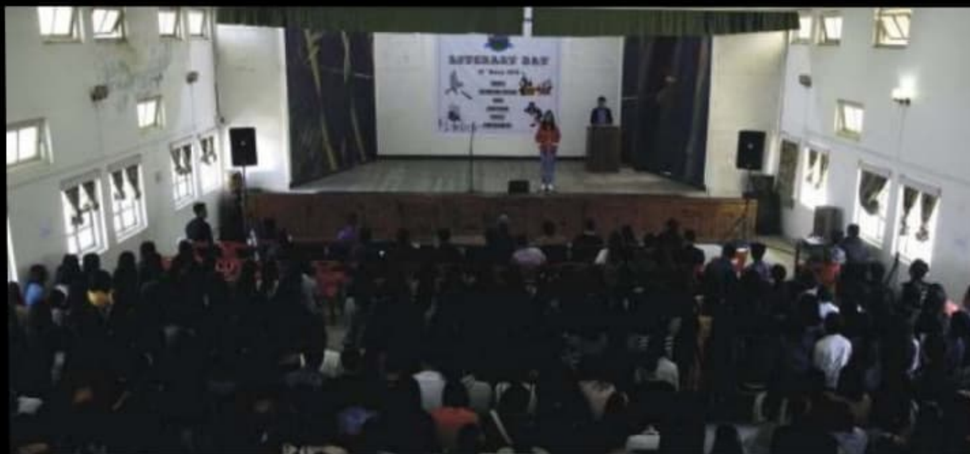
BCK, Literary Day held at Ura Academy Hall, Kohima.