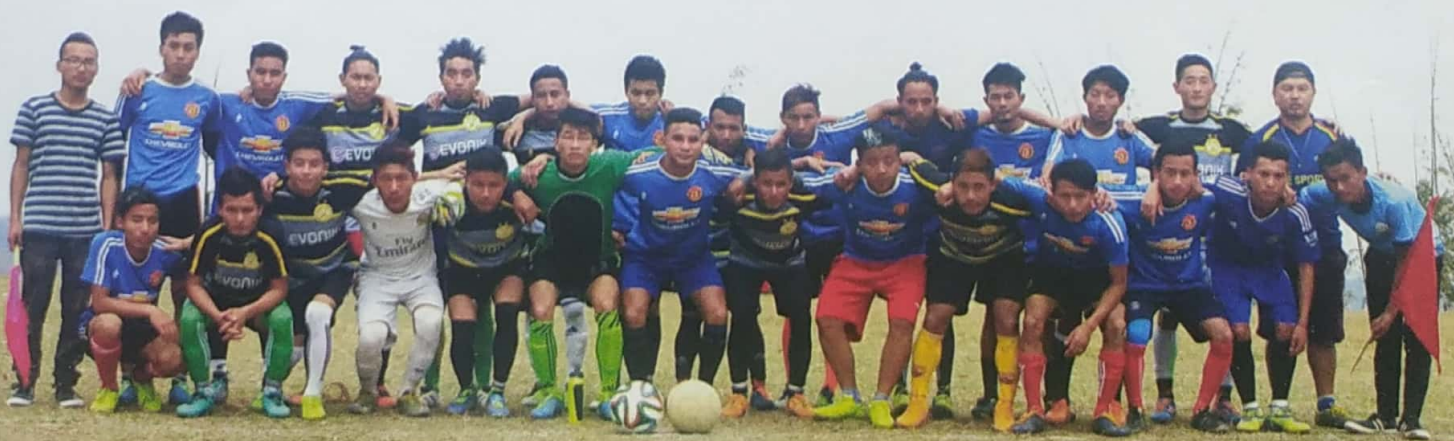
SPORTS MEET 2017